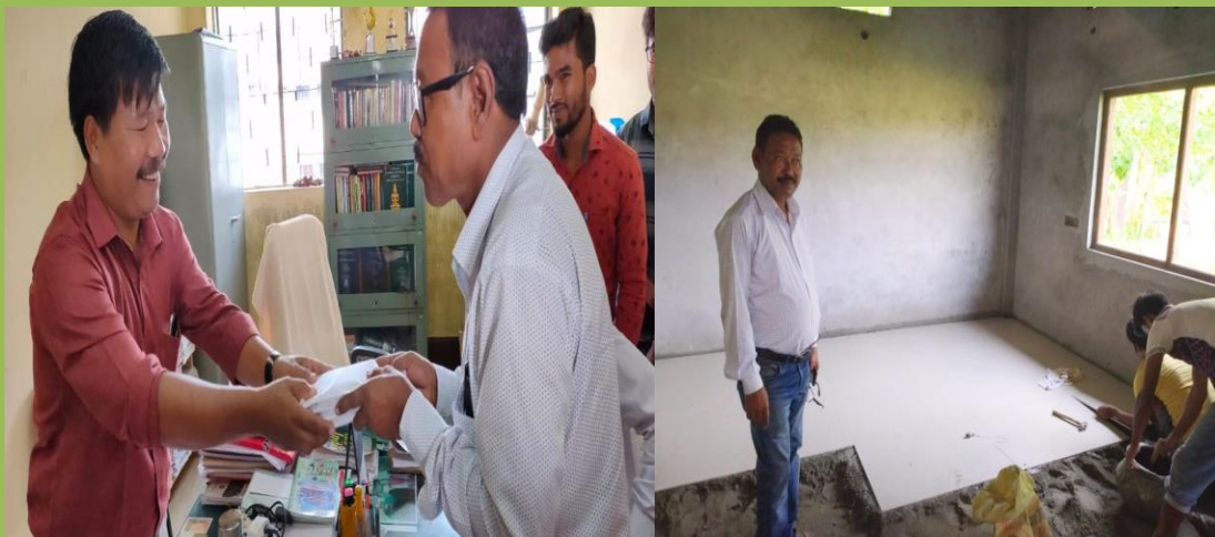
A small contribution from NSS Unit-II to make Free of Cost Hospital, an initiative by Bike Ambulance Dada

NSS Unit-II initiated a fund raiser programme in campus area to help and contribute some financial donation to Padmashree Karimul Haque for his Free of Cost Hospital in his village. All the volunteers work together to raise fund for this noble cause. And the final outcome of the fund raiser programme was very successful one. The Programme Officer NSS Unit-II conferred the financial help to Bike Ambulance Dada to be a part of his dream hospital. After a few months we have received his response by sharing a picture of his hospital and its work in progress to help the poor people to get fine treatment at free of cost.