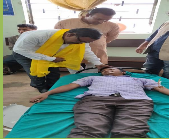
Encouragement to the donors by Padmashree Karimul Haque