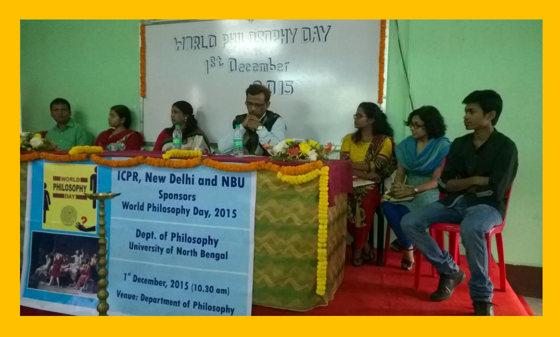
Research Scholars presenting papers in World Philosophy Day, 2015

• UGC-Sponsored National Seminar on 'Reason, Emotion & Dream: Philosophical Excavations' on November 23, 2015.