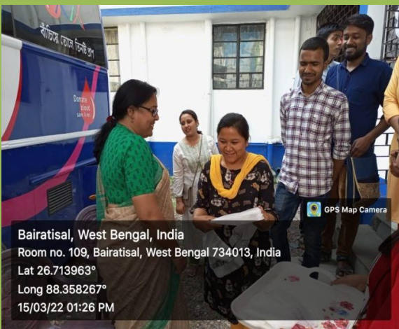
Bairatisal, West Bengal, India Room no. 109, Bairatisal, West Bengal 734013, India Lat 26.713963° Long 88.358267° 15/03/22 01:26 PM