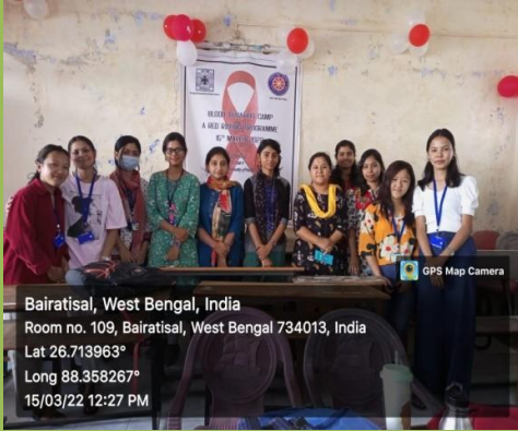
Bairatisal, West Bengal, India Room no. 109, Bairatisal, West Bengal 734013, India Lat 26.713963° Long 88.358267° 15/03/22 12:27 PM