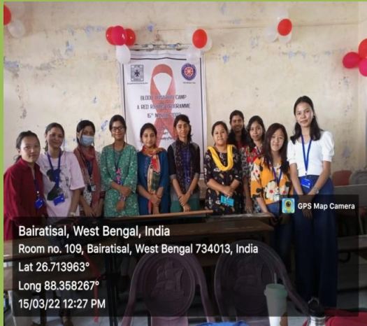
Bairatisal, West Bengal, India Room no. 109, Bairatisal, West Bengal 734013, India Lat 26.713963° Long 88.358267° 15/03/22 12:27 PM