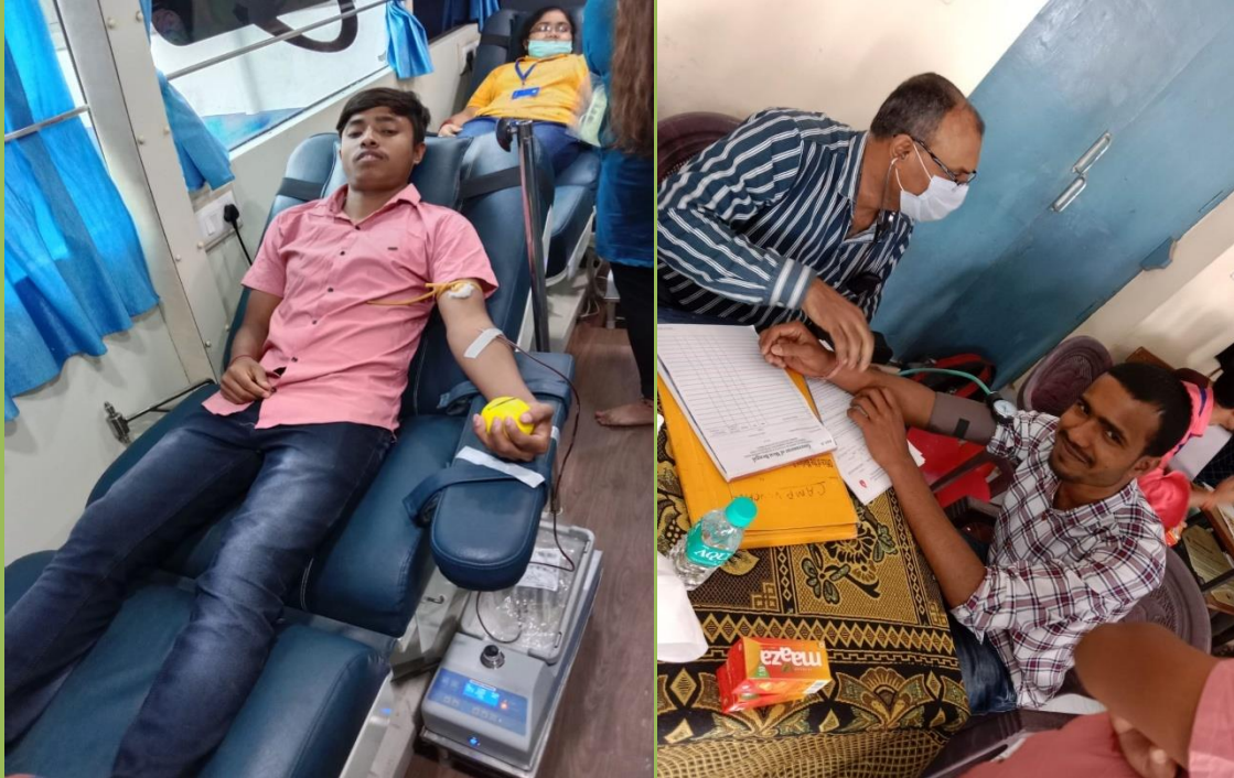
Blood donated by the NSS Unit-II Volunteers

The doctors and blood collecting technicians of the Blood Bank of North Bengal Medical College and Hospital are immediate on their response to share the responsibility towards society along with us by collecting the blood. NSS Unit-II provided the food to the donors so that after giving the valuable life saving blood, donors won't feel illness and the volunteers played the key role to taken care of the donors.