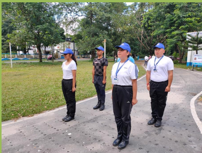
Some Glimpses of Pre-RD Camp at NBU