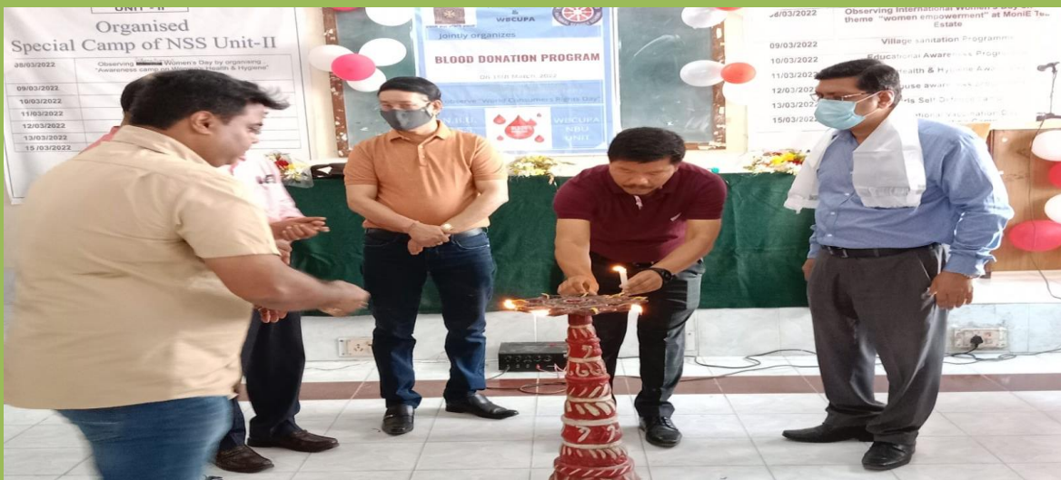
Lighten up the Diya to inaugurate the Blood Donation Camp and to encourage the Blood Donors

The doctors and blood collecting technicians of the Blood Bank of North Bengal Medical College and Hospital are immediate on their response to share the responsibility towards society along with us by collecting the blood. NSS Unit-II provided the food to the donors so that after giving the valuable life saving blood, donors won't feel illness and the volunteers played the key role to taken care of the donors.