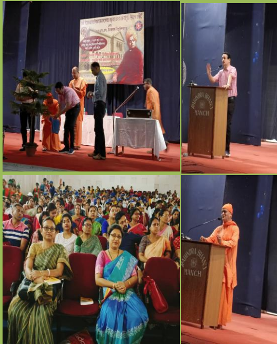
Some Glimpses of Orientation Program