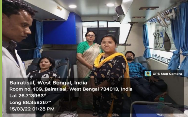
Bairatisal, West Bengal, India Room no. 109, Bairatisal, West Bengal 734013, India Lat 26.713963° Long 88.358267° 15/03/22 01:28 PM