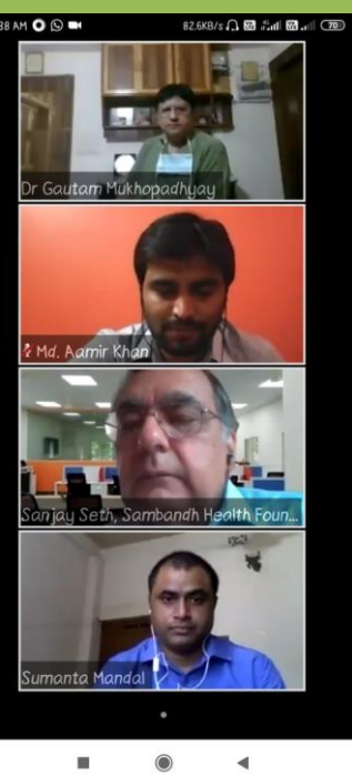
Flyer and Glimpses of the Webinar.