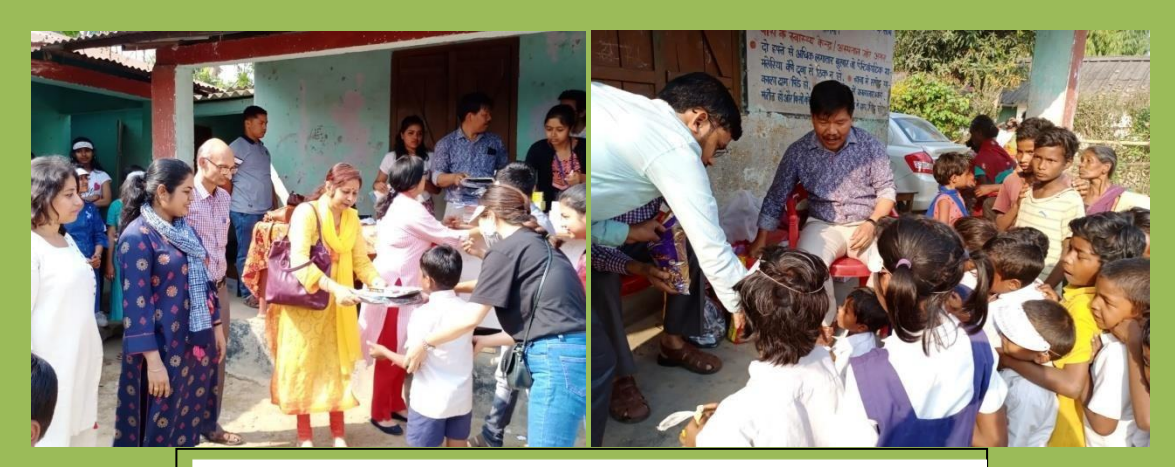
Tiffin and onetime meal has been arranged by NSS Unit-II

One of the major problems in the tea garden area is that the unstoppable breeding of mosquitoes and flies. To solve this problem NSS Unit-II distributed mosquito nets among villagers. Volunteers went door-to-door to share the cause and remedies of mosquito breeding in their houses.