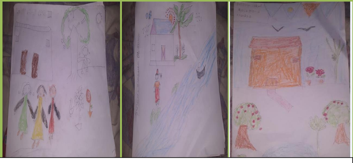
Open Art function has been organised for the little students to bring out creativity

Art is the expression of inner self. To bring out the creative mind from the little minds NSS Unit-II has been organised a Open Art Function for the students. We have distributed the needed materials for drawing such as art copy, colour pencil, etc. And the results we have got were very expressive as you can see in the pictures.