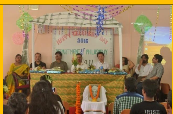
Teachers' Day being celebrated in the Department