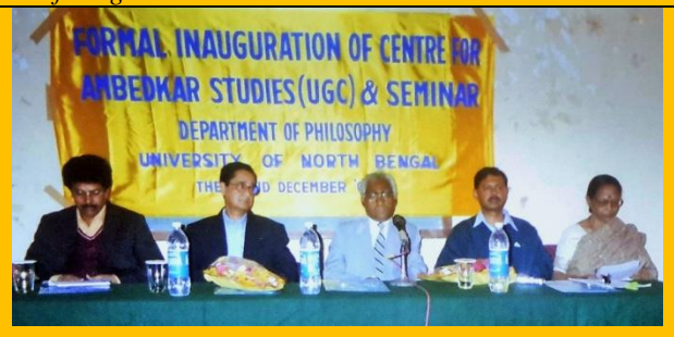
Inaugural Seminar of Ambedkar Studies Centre