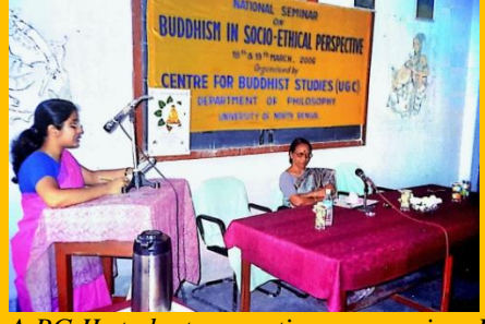
A PG II student presenting a paper in a Buddhist Studies seminar